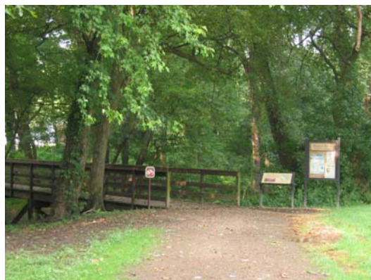
Bridge to Virginus Island

Stop at the Virginus Island Bridge and re-orient the students using their maps (Figure 8 – Virginus Island Trail Map). Divide students into groups to be accompanied by a ranger/educator, and explain that they will be performing their field studies at four locations along Virginus Island. Use the Field Study Map on page 11 to orient students to the island. Students have the same map in the Student Field Study Guide