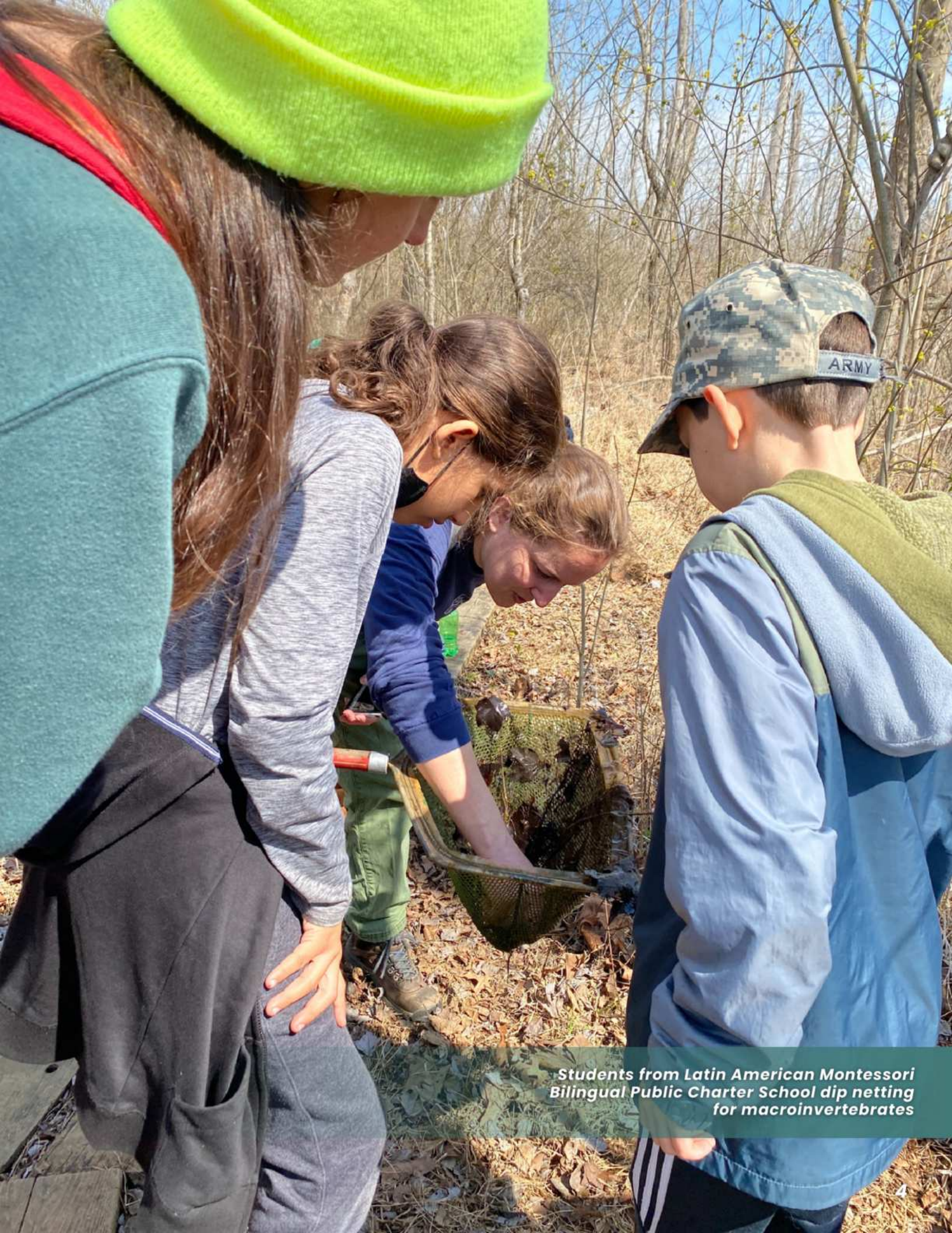
Students from Latin American Montessori Bilingual Public Charter School dip netting for macroinvertebrates