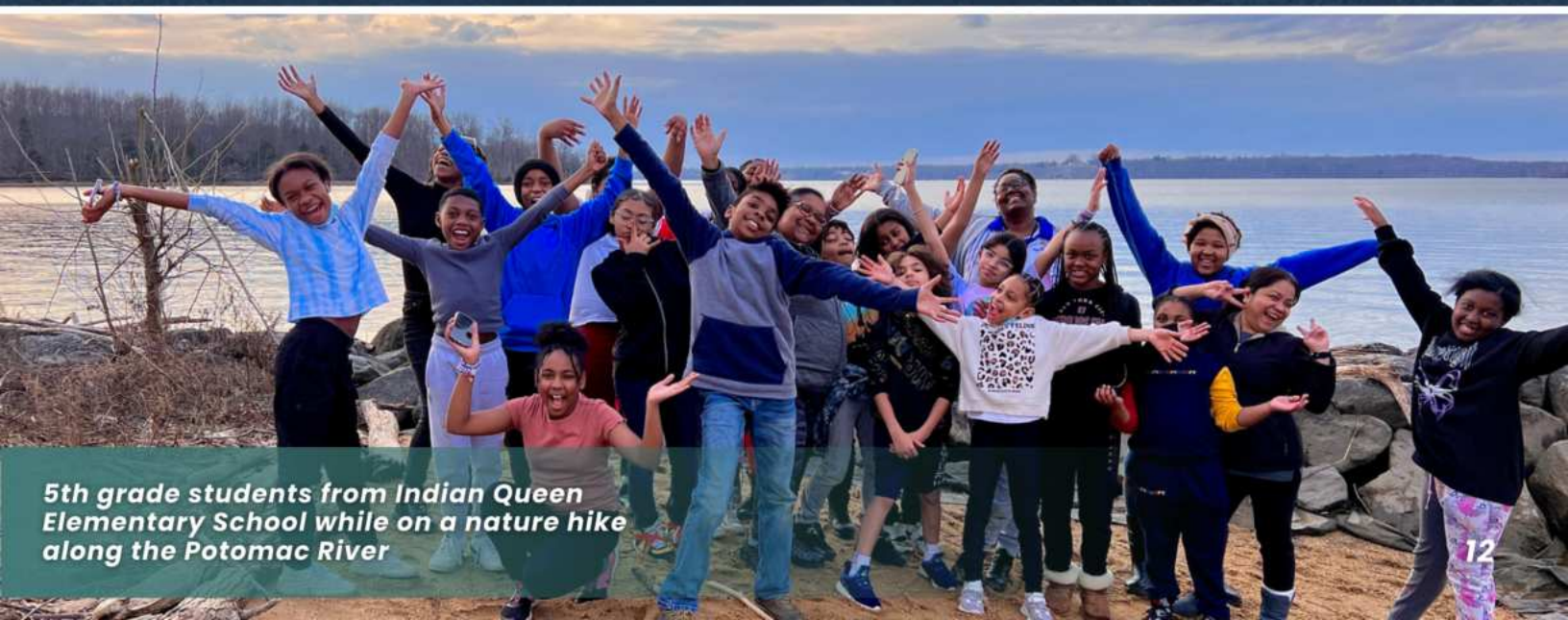
5th grade students from Indian Queen Elementary School while on a nature hike along the Potomac River

Thanks to our supporters, the Alice Ferguson Foundation was named the 2023 winner in the Maryland Day Camps, Hikes & Nature Discovery, and Fairs & Festivals categories in Washington Parent's prestigious annual Parent Picks competition and a finalist in the STEM Programs and STEM Camp categories.