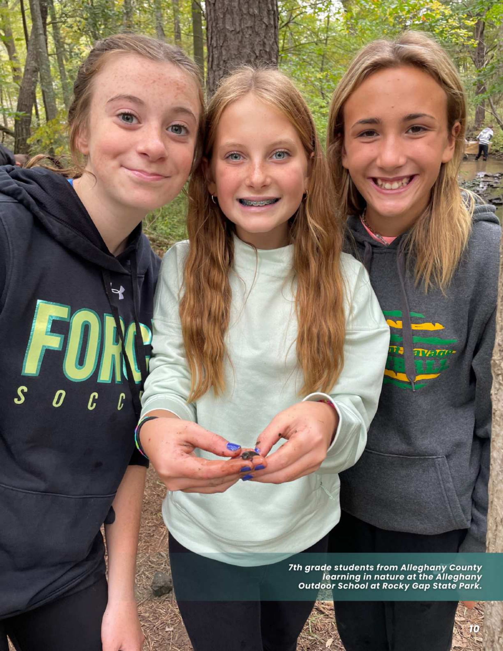
7th grade students from Allegheny County learning in nature at the Allegheny Outdoor School at Rocky Gap State Park.