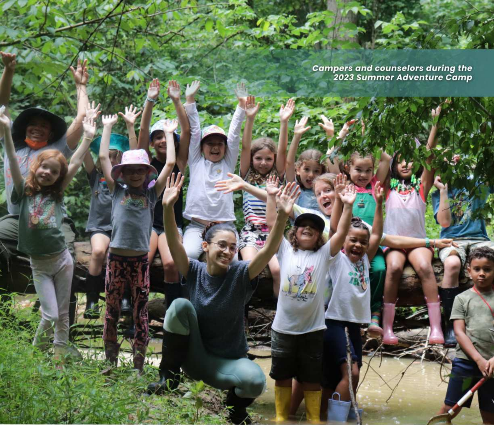
Campers and counselors during the 2023 Summer Adventure Camp